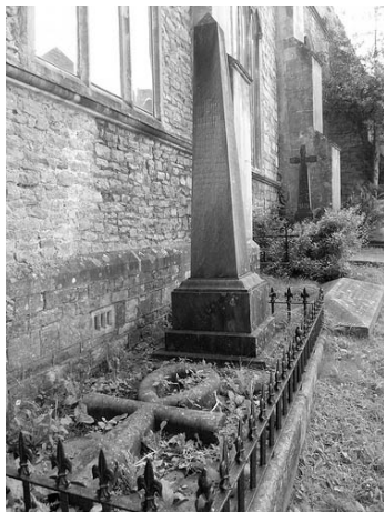
Flinders Petrie's Grave, Jerusalem.