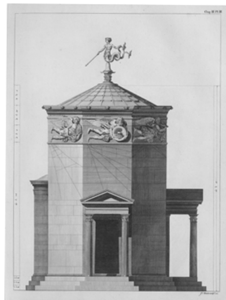
Athens, the Tower of the Winds From Stuart and Revett, Antiquities

Details of events over the next three months compiled by BANEA Southeast arrived too late for this bulletin but will be made available on the ASTENE website.