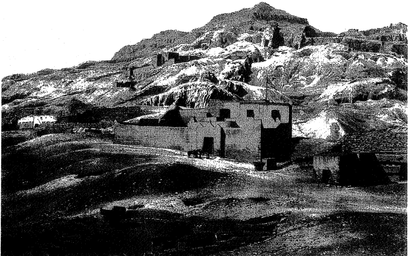
145 Yanni's house on Sheikh abd el Qurna, built by Henry Salt c.1820. Lithograph from a photo taken in 1855. Rhind 1862, Plate II opp. p.38.