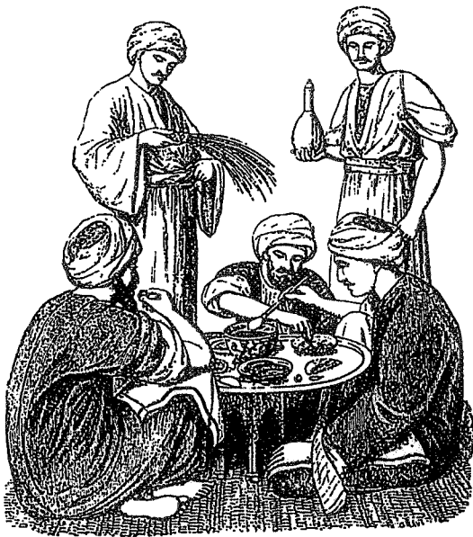
A PARTY AT DINNER OR SUPPER.