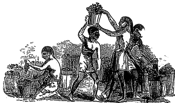
EGYPTIAN VINE GATHERERS.