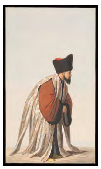
Depiction of a Grand Dragoman c. 1809, by an anonymous Greek artist in Constantinople

The career dragoman developed in Egypt, from the 1890s to 1952, with the development of tourism and the increase in the number of tourists. This study deals with the development of the dragoman's skills, his job duties and the impact of political affairs in Egypt (1863–1952) on the profession of dragoman, also the relationship between this career and the country. There will be an attempt to touch the community's attitude towards this job in Egypt.