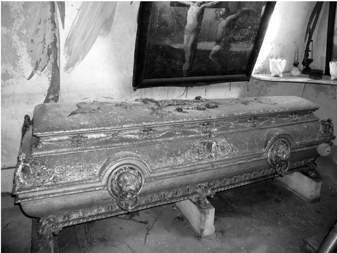
The stainless steel and gilt coffin of Sir Richard Burton in the Mausoleum