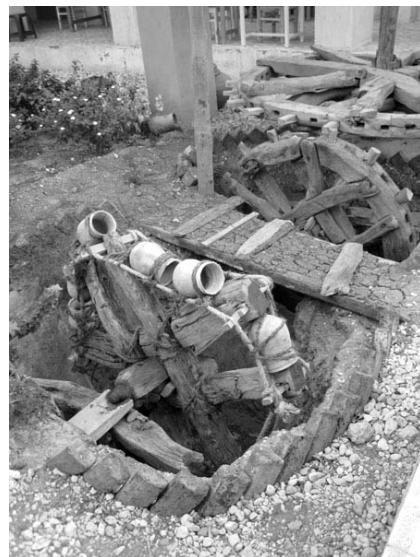
The Saqieh at Balady Handicrafts.