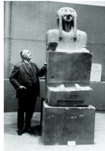
Max von Oppenheim (1860-1946) with one of the statues from Tell Halaf ( www.oppenheim.lu )

For further details of both exhibitions please refer to the following English-language website: http://www.smb.museum/smb